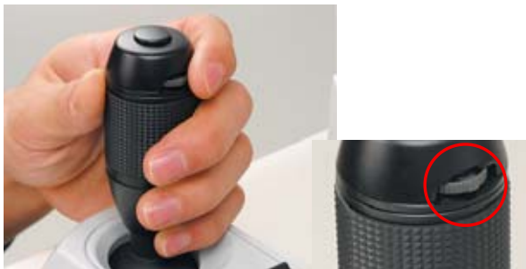
Unique Joystick “Smart Switch”

The user has three choices from among energy up, energy down, ready/standby, aiming up, aiming down, burst and reset.