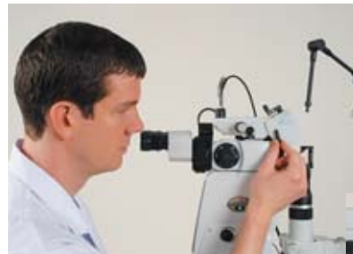
The YC-GYC changeover lever

Space requirements are minimized, and the combination adapter (optional) includes the split mirror illumination tower.