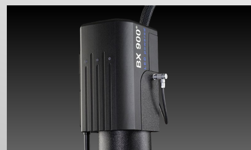
Standard LED illumination