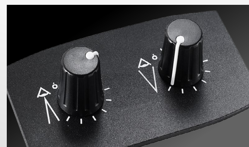
Ergonomic one-hand control

From the latest release on the automated import of images in various formats is supported* and can be activated with a dongle license code. This allows that now also the BX 900 can be integrated in the standard Haag-Streit EyeSuite software.